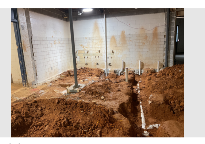
Description Sanitary Rough Area D